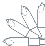
PACK OF 4